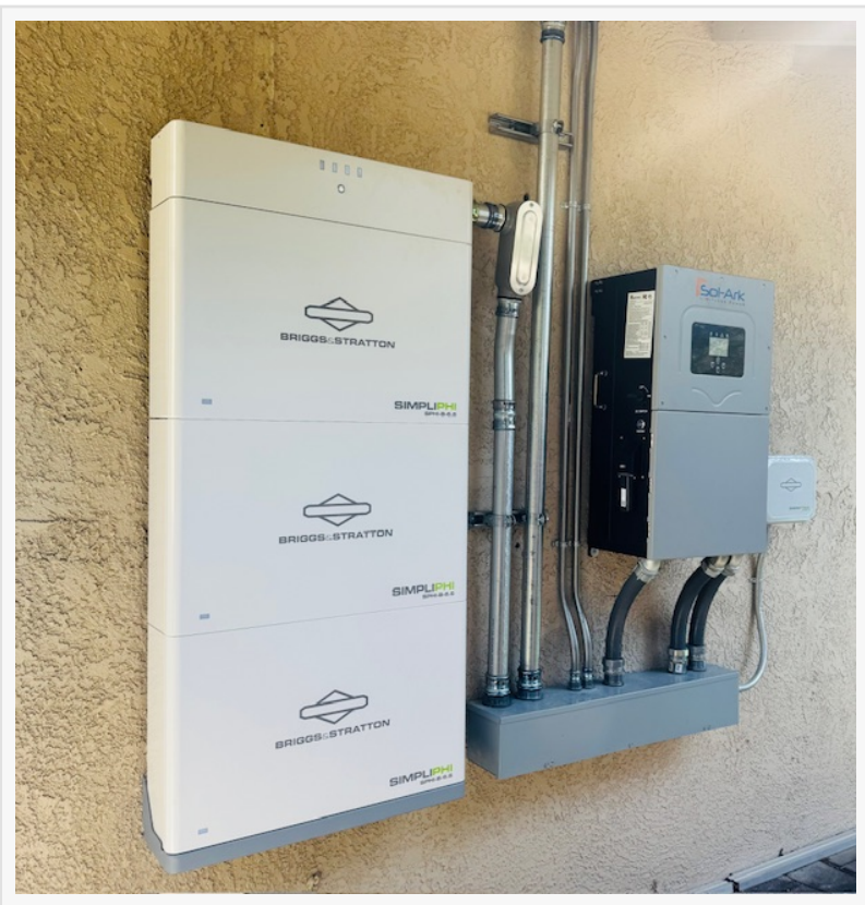
Briggs & Stratton battery install

One of the most effective battery solutions comes from <u>Briggs & Stratton</u>, a local Oxnard-based company known for its safe, efficient, and long-lasting lithium-ion battery storage systems. These batteries integrate seamlessly with solar energy or grid power, providing homeowners and businesses with a sustainable, cost-effective power solution during outages.