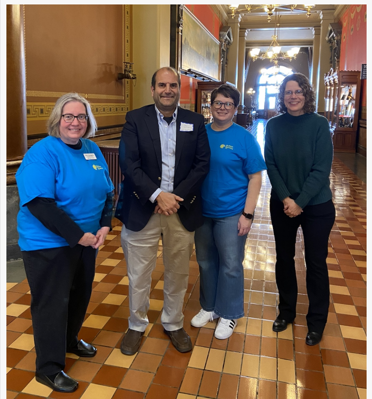
TravelingWiki Joins Autism Society of Iowa Leadership Following My Remarks to Attendees at Iowa State Capitol During 2025 Autism Advocacy and Acceptance Day on the Hill

(13) Appearance at Show of Cam Newton With NLE Choppa on Autism Awareness Surrounding His