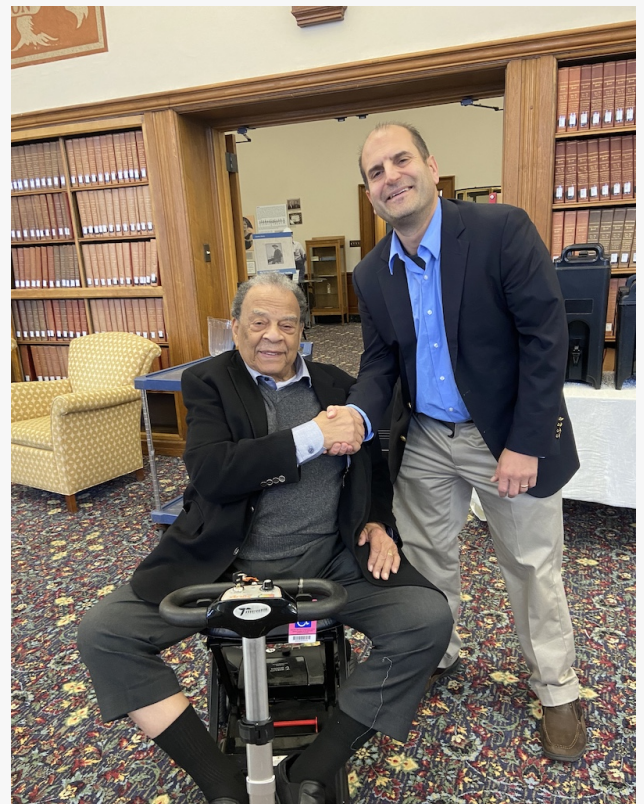
TravelingWiki Brought to Drake University to Engage with Former UN Ambassador Andrew Young