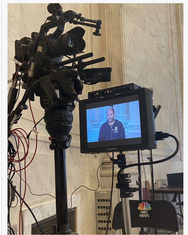
TravelingWiki with NBC News on Capitol Hill to Promote Autism Awareness