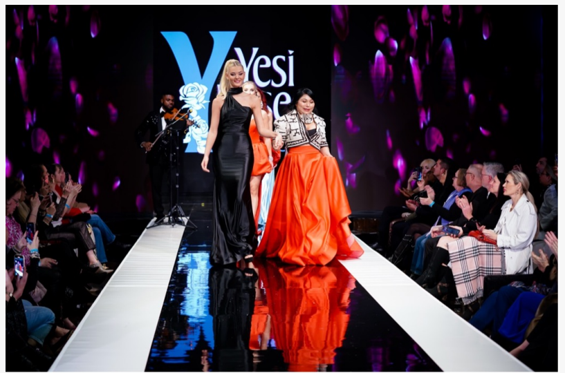
Yves Rose Fashion with Victoria Kjaer Theilvig, Miss Universe 2024

IG: @hiTechMODA | F: hitechmoda | X / T: @HitechModa | Y: @hitechmoda