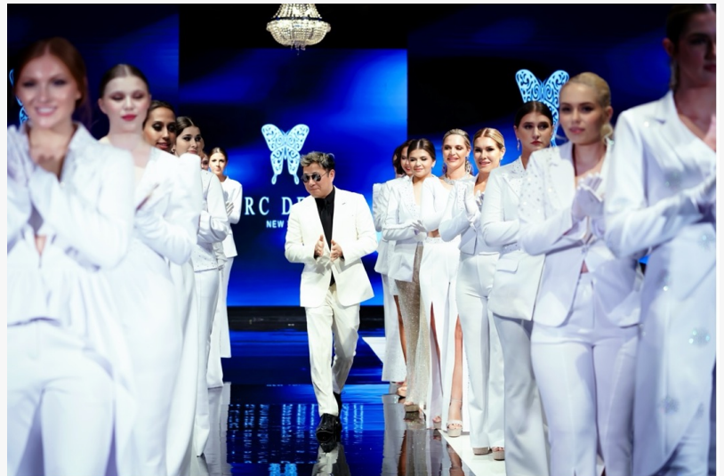
Marc Defang Show