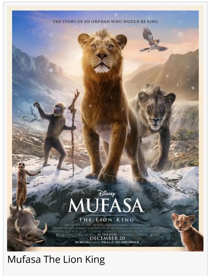
Mufasa The Lion King