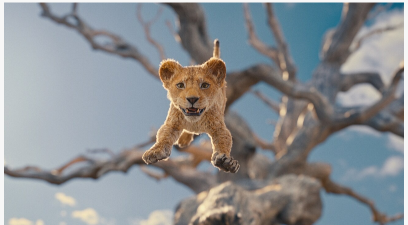
Mufasa: The Lion King's Virtual Art Department