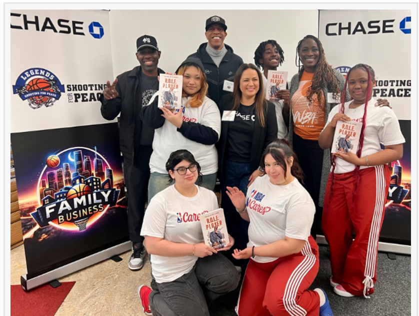
Jerome "Junk Yard Dog" Williams R.O.L.E PLAYER | Family Business

Jerome “Junk Yard Dog” Williams is a former NBA star and basketball philanthropist known for his