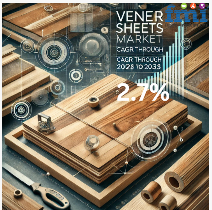
Veneer Sheets Market

NEWARK, DE, UNITED STATES, February 14, 2025 /EINPresswire.com/ -- The global veneer sheets market is projected to grow from USD 42 billion in 2023 to USD 55 billion by 2033, expanding at a CAGR of 2.7%. This growth is driven by rising demand in interior design, furniture, and construction industries due to veneer sheets' aesthetic appeal, durability, and eco-friendly attributes. Increasing consumer preference for premium wood finishes and sustainable materials further propels market expansion, while advancements in manufacturing technologies enhance product quality and availability across diverse applications.