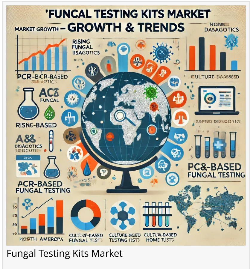
Fungal Testing Kits Market

The burgeoning demand for fungal testing equipment stems from the rising prevalence of fungal infections and heightened awareness of their serious health implications. Conditions like