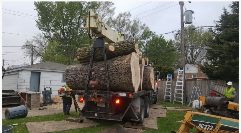
Tree Removal in Berwyn