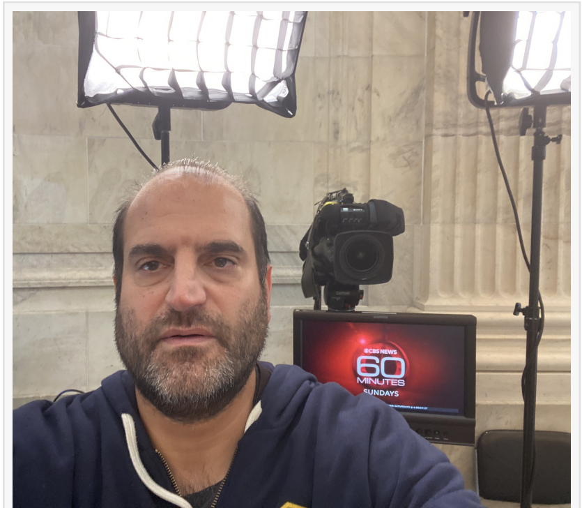
TravelingWiki with CBS News on Capitol Hill