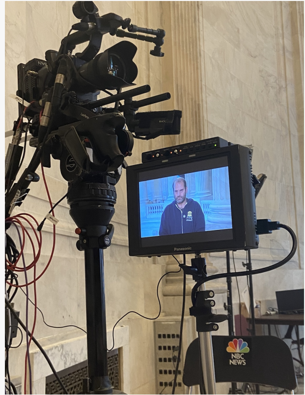
TravelingWiki with NBC News on Capitol Hill to Promote Autism Awareness

All of these activities surround recent landmarks for TravelingWiki. Microsoft's CoPilot AI recently hailed TravelingWiki as "one of the Fastest-Growing Resources for Autism-Friendly Airport Information" Globally. This is contemporaneous with a surge of interest in Asia, with various Asia-based searches for travel in the US resulting in TravelingWiki Foundation being the top result for organic and/or AI based search. Specifically, as of February 6, 2025, TravelingWiki is now the top organic and AI search result for some Autism searches on Baidu (China) & Naver (South Korea).