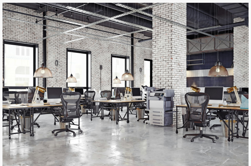
7am Epiphany Office

NEW ORLEANS, LA, UNITED STATES, February 14, 2025 /EINPresswire.com/ -- After a strategic two-year hiatus focused on pioneering advancements in AI product training, UX website design, and product development, 7am Epiphany, an award-winning boutique agency based in Louisiana, is proud to announce its grand relaunch. Specializing in top-tier UX design, SEO, and advertising, 7am Epiphany is now offering revitalized services tailored to businesses of all sizes, from small startups to large enterprises, through a suite of affordable, custom price packages, all built on the innovative Shopify platform.