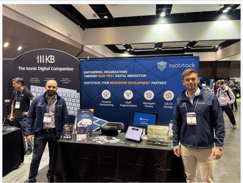
Rootstack at Developerweek 2025

Rootstack actively participated in DeveloperWeek 2025, the world's largest event for developers and engineers. The conference, which took place from December 11 to 13 at the Santa Clara Convention Center, brought together technology leaders, startups, and developers from around the world to discuss the latest trends in technology and innovation.