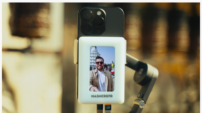
Using MagMirror for Selfies

Inspiration: A Founding Vision Born from Everyday Frustrations The concept for MagMirror took shape when its founder, an aspiring YouTuber, realized they were missing crucial shots due to poor framing and uneven lighting. Whether recording makeup tutorials or filming family vacations, using the rear camera meant higher resolution but less certainty about composition. The problem was amplified on group trips, where handing a phone to a stranger often resulted in off-center or poorly lit photos.