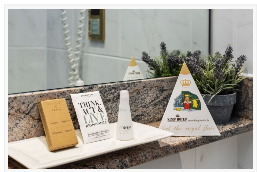
Eco-conscious sustainable hotel, KING's Hotels Munich

MUNICH, MUNICH, GERMANY, February 15, 2025 /EINPresswire.com/ -- KING's Hotels Munich has proudly announced its recertification as a member of the prestigious Bavarian Environment and Climate Pact. This achievement highlights the boutique hotel group's unwavering dedication to environmental sustainability and reinforces its status as a trailblazer in eco-friendly hospitality.