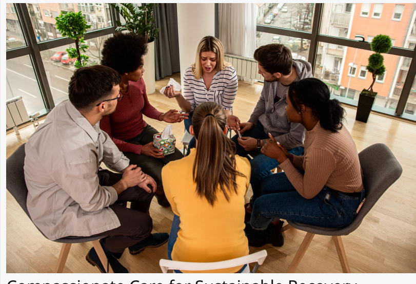
Compassionate Care for Sustainable Recovery