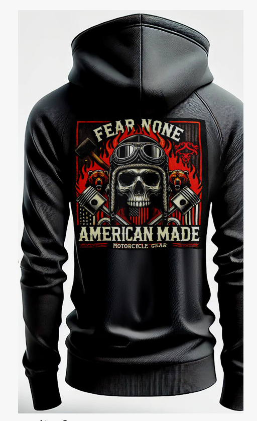
Hoodie front 2