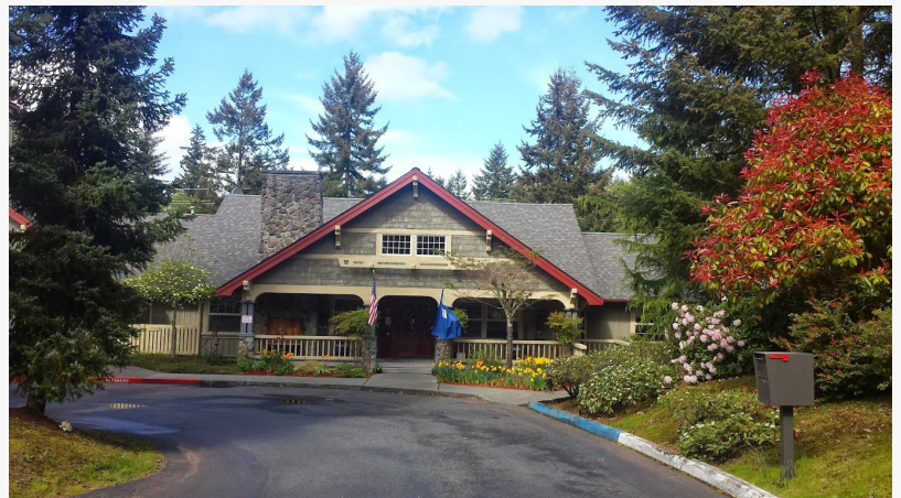
Greenlake Senior Living Gig harbor