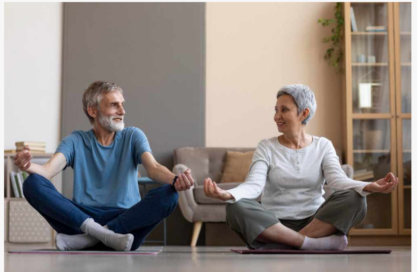
assisted living Tacoma - Yoga Picture