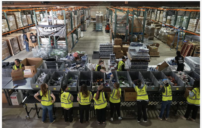
GEM BStrong Los Angeles Headquarters