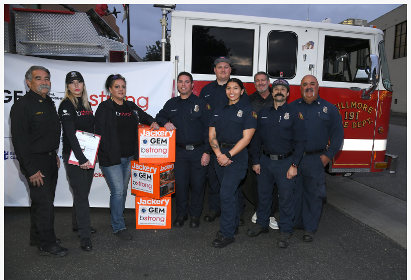
GEM BStrong with Fillmore Volunteer Fire Department