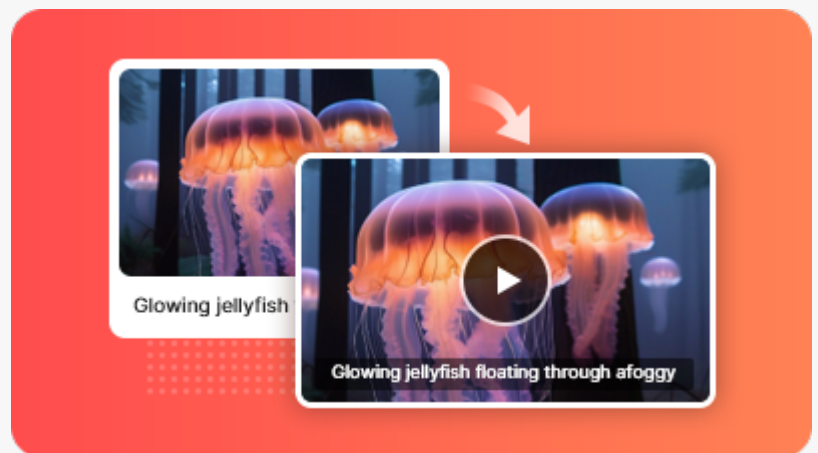
Mango Animate launches an AI animation generator to make video more engaging.