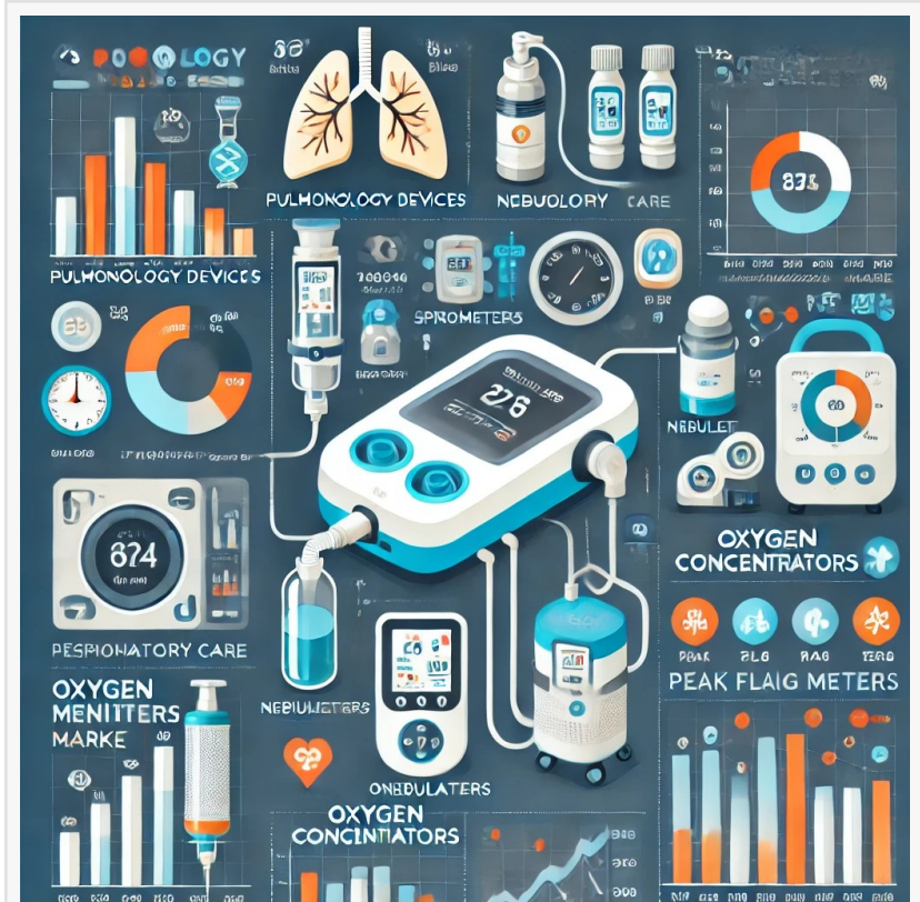
Pulmonology Devices Market

This rapid growth highlights the increasing demand for advanced technologies and innovative solutions to address the rising burden of respiratory diseases, particularly among the aging global population. As chronic respiratory conditions and acute illnesses continue to escalate, the need for state-of-the-art pulmonology devices is becoming more urgent than ever. These devices are essential for the accurate diagnosis, effective management, and treatment of a wide range of respiratory ailments, ultimately improving patient outcomes and enhancing quality of life.