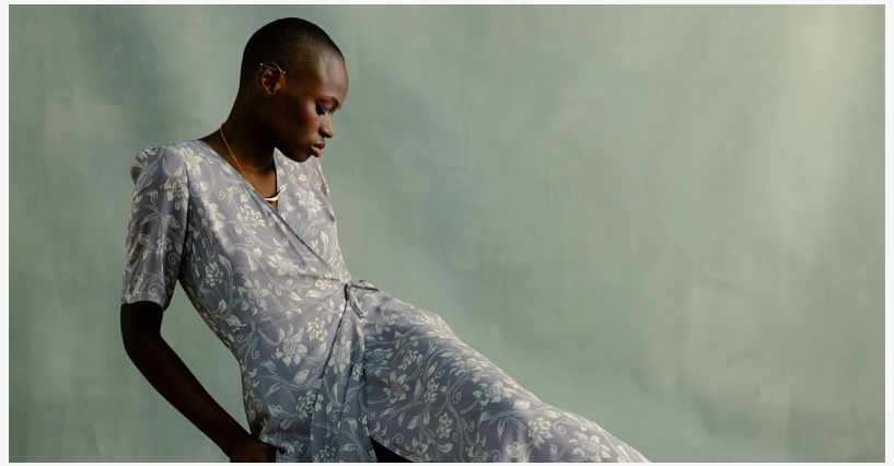
Reistor’s new spring collection