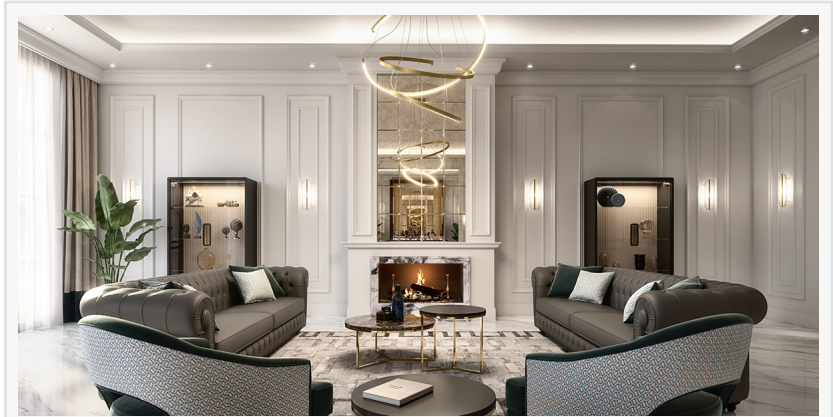
Living room and lighting, "Elegant Project" by Sevensedie

The elegance project emphasizes environmental sustainability and design flexibility of modern and contemporary Italian furniture. The initiative implements responsibly sourced materials and production methods designed to reduce environmental impact. This approach addresses both environmental considerations and evolving requirements in the Ho.Re.Ca. sector.