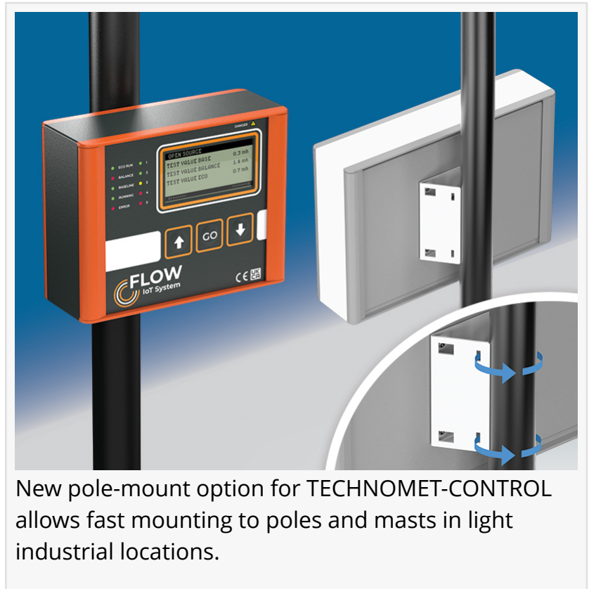
New pole-mount option for TECHNOMET-CONTROL allows fast mounting to poles and masts in light industrial locations.

The new pole mounting bracket fits the standard VESA mounting holes on the rear panel of all sizes of TECHNOMET-CONTROL . It is manufactured from mild steel CR4, is powder coated traffic white (RAL 9016), weighs 1.10 lbs and is supplied with four M4 x 6 mm fixing screws. Four slots allow plastic or metal straps to be used to secure the bracket to the pole or mast.