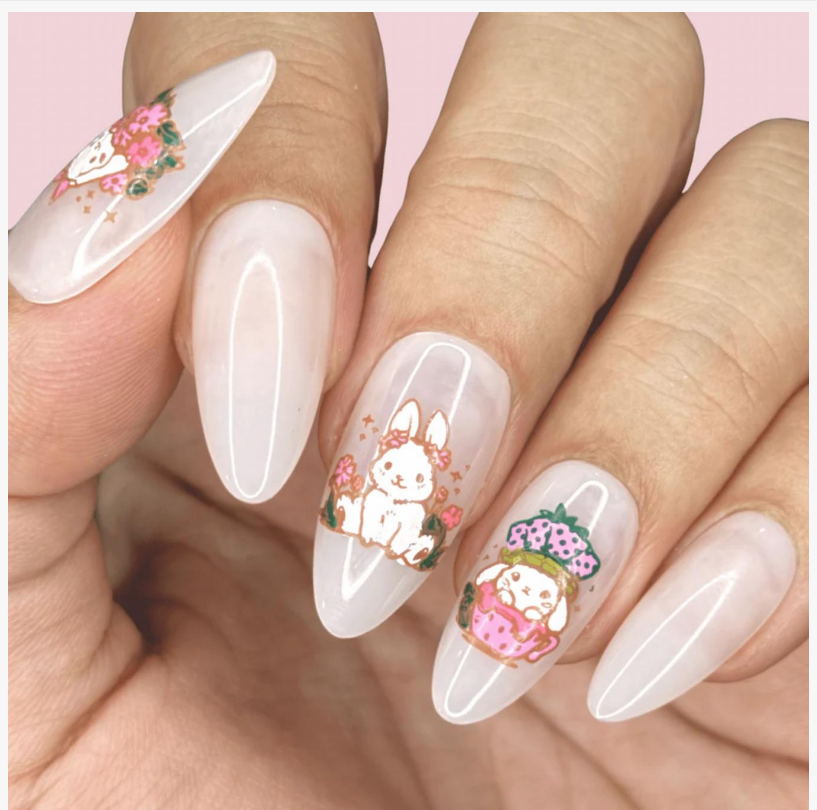
This adorable collection of bunnies and baskets was made with one of Maniology's festive Nail Stamping Starter Kits.

Maniology has built their stellar reputation on their nail stamping products and nail art supplies. These products allow customers to achieve salon-quality nail designs from the comfort of their homes.