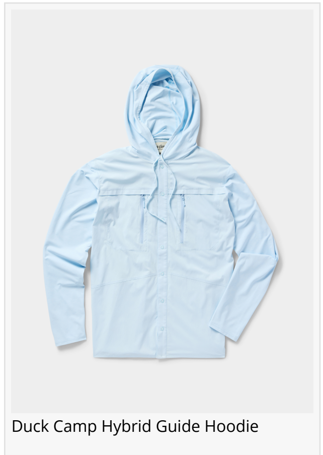
Duck Camp Hybrid Guide Hoodie

Lightweight Performance drirelease® Hoodie - A lightweight sun protective hoodie that keeps you comfortable in hot conditions and pulls double duty as a wicking base layer, this technical go-to shirt dries four times faster than cotton and is rated at UPF 30+. Crafted with drirelease®