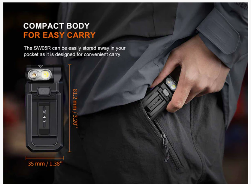
Fenix SW05R Clip On Light