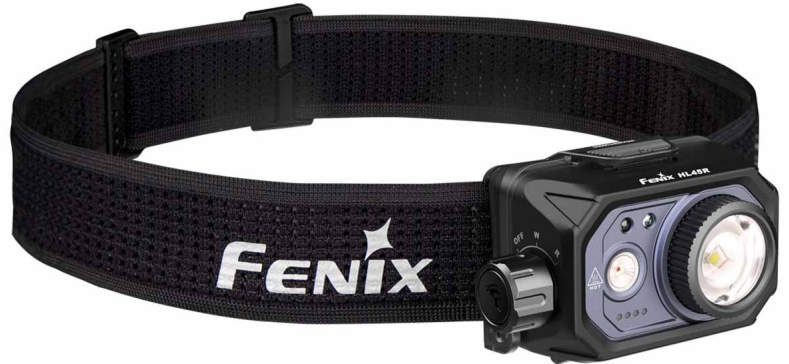
Fenix HL45R Rechargeable Headlamp