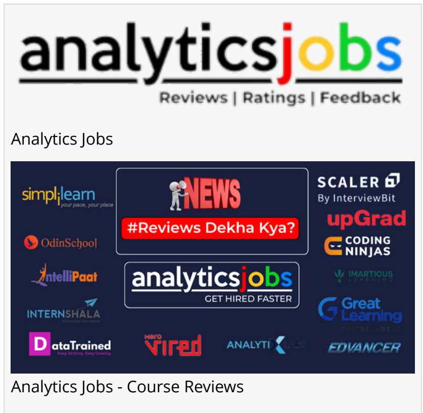
Analytics Jobs - Course Reviews

Newton School Complaints (Quora, Reddit, Email): Reported issues include customer service