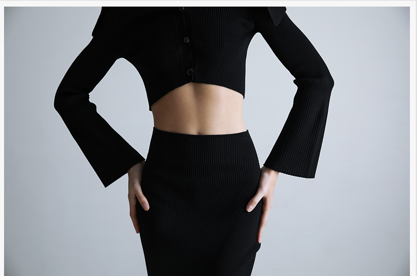
Libra cropped Cardigan and Juno Pencil Skirt