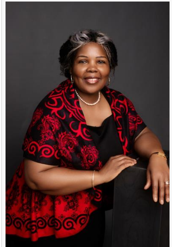
THE AMAZING AUTHOR

Finding Purpose In Loss: Every Life Has a Purpose is now available for purchase on [list