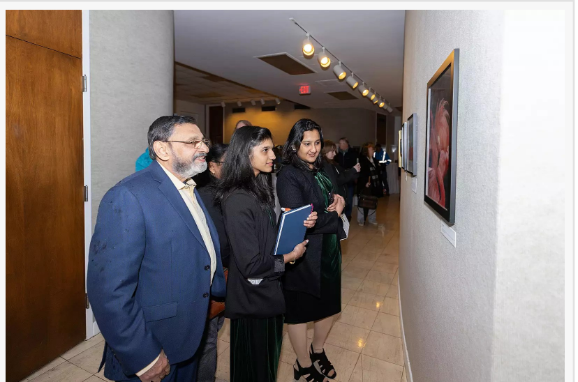
Four high school students earn scholarships during Juried High School Art Exhibition.

AMHERST, VA, UNITED STATES, February 20, 2025 /EINPresswire.com/ -- The 3rd Bi-Annual Juried High School Art Exhibition welcomed a selection of talented young female artists to campus on Feb. 15 to celebrate their incredible work. This special exhibition allows high school girls nationwide to professionally show their work, learn more about it, and earn a partial scholarship to Sweet Briar College.