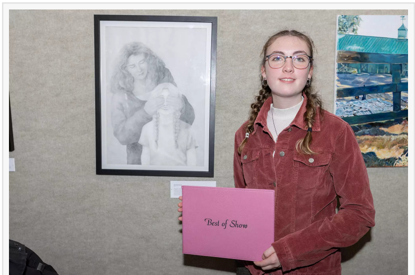
Best in Show: Veil by Savannah B.

To learn more visit Sweet Briar College Arts https://www.sbc.edu/center-for-creativity-design-and-the-arts/art-majors-and-programs/ or contact Admissions at admissions@sbcc.edu or 434-