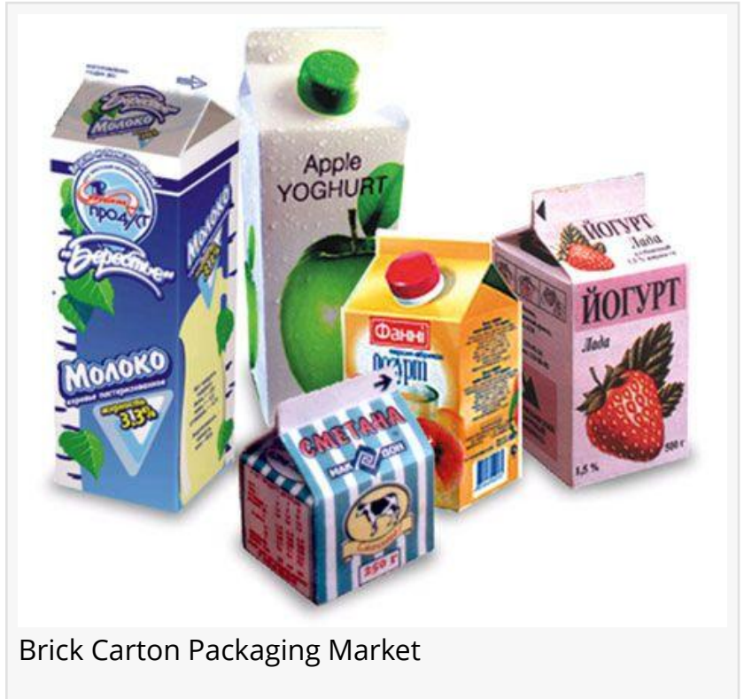
Brick Carton Packaging Market

Brick Carton Packaging Market in terms of revenue was estimated to be worth at $28 billion in 2024 & is poised to reach $43 billion by 2034, growing at a CAGR 4.7%