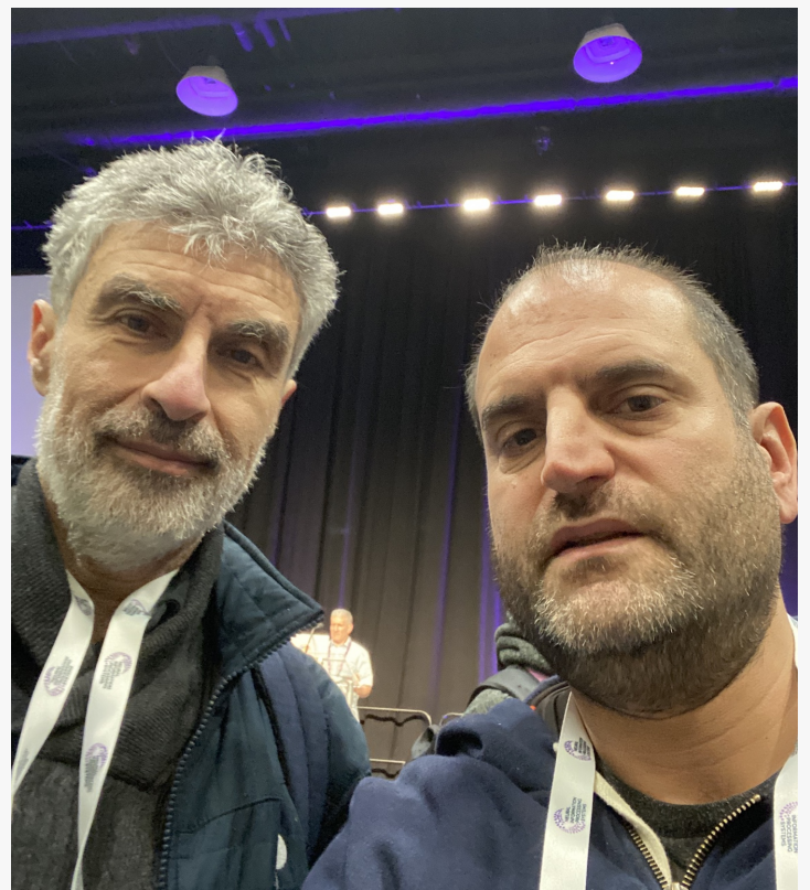
TravelingWiki At the Test of Time Lecture with Dr. Yoshua Bengio