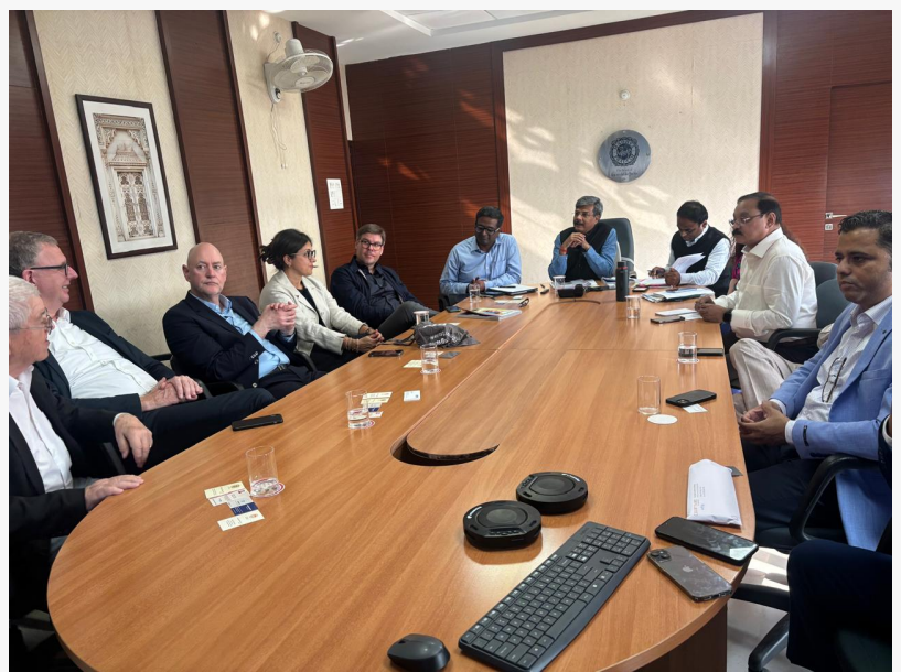
The German Delegation engaged in a fruitful discussion with officials from the Madhya Pradesh Tourism Board (MPTB),

Madhya Pradesh's diverse tourism offerings were highlighted as a major draw for German visitors. These include UNESCO World Heritage Sites such as Bhimbetka, Sanchi, and Khajuraho, which cater to those interested in archaeology and heritage. The state's well-preserved national parks, including Kanha, Bandhavgarh, and Panna, were recognized as prime destinations for wildlife and nature-based tourism, attracting adventure-seeking travelers. Additionally, the