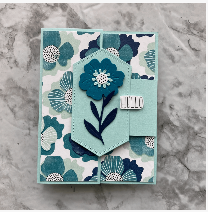
PASTEL BLUE- Smooth 12x12 Cardstock - Bazzill Smoothies Collection

Packaging waste remains a significant concern across industries. In response, 12 x 12 Cardstock Shop has introduced alternatives designed to minimize excess material use. Paper-based adhesives and compostable packing materials have replaced conventional