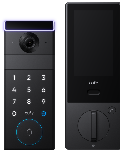
eufy FamiLock S3 Max video smart lock