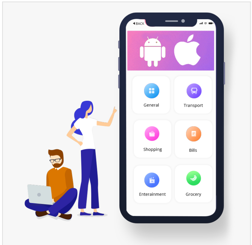
Mobile app development