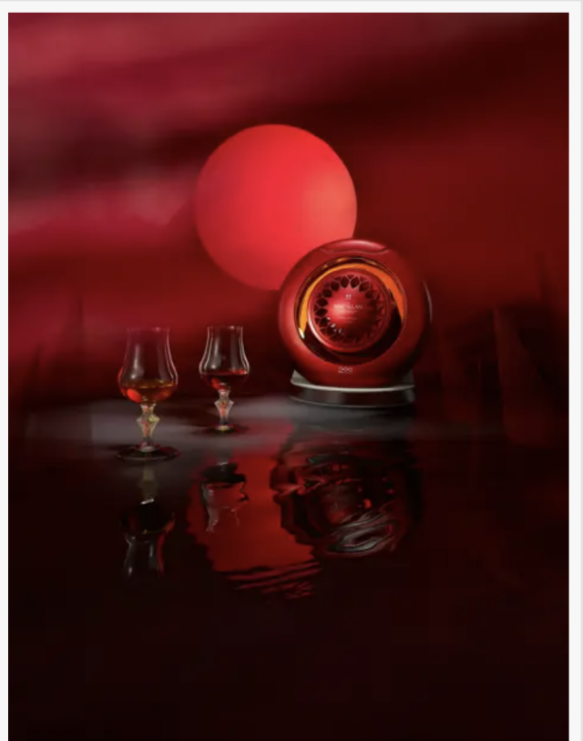
The Macallan TIME : SPACE