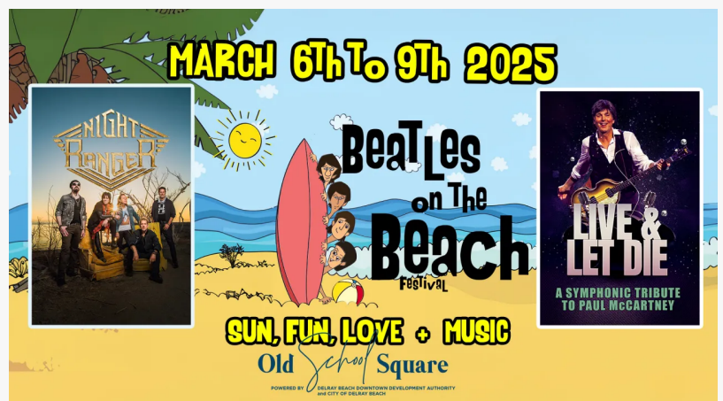
Beatles on the Beach 2025