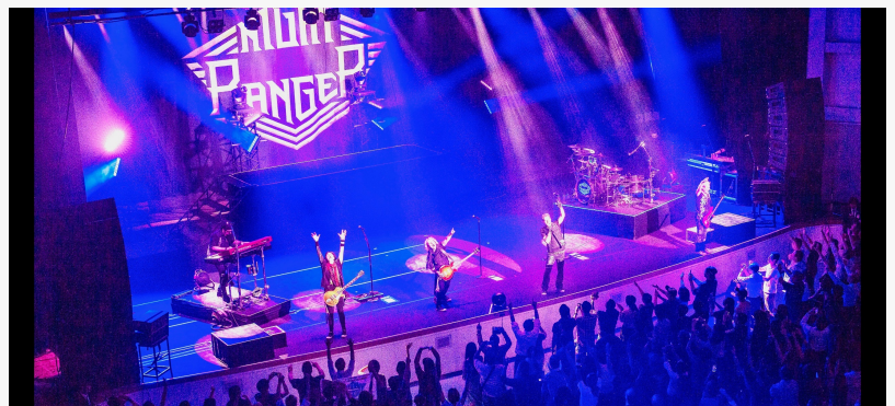
Beatles on the Beach 2025