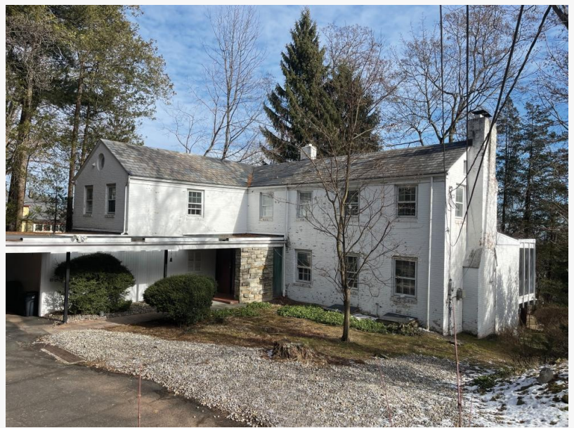
4-Bedroom Brick Home

WEST ORANGE, NJ, UNITED STATES, February 19, 2025 /EINPresswire.com/ -- Max Spann Real Estate & Auction Co announces the upcoming Auction of a quaint and strategically located 4-bedroom home at 57 Winding Way in West Orange , New Jersey. Situated just 17 miles from Manhattan and easily accessible by major highways, the site boasts an expansive backyard and sits on approximately 0.33 Acres. The Property will be offered in an online auction concluding on March 19, 2025.