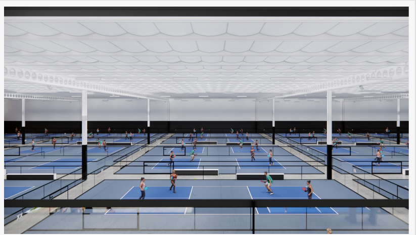
PURE interior rendering

to-play after injury, and strength and conditioning for PURE members, guests, and visitors. This collaboration brings leading sports medicine and orthopedic services to serve the Valley's booming pickleball community. The facility will host members, guests, drop-in players, field trips, special and corporate events, and national-level tournaments.