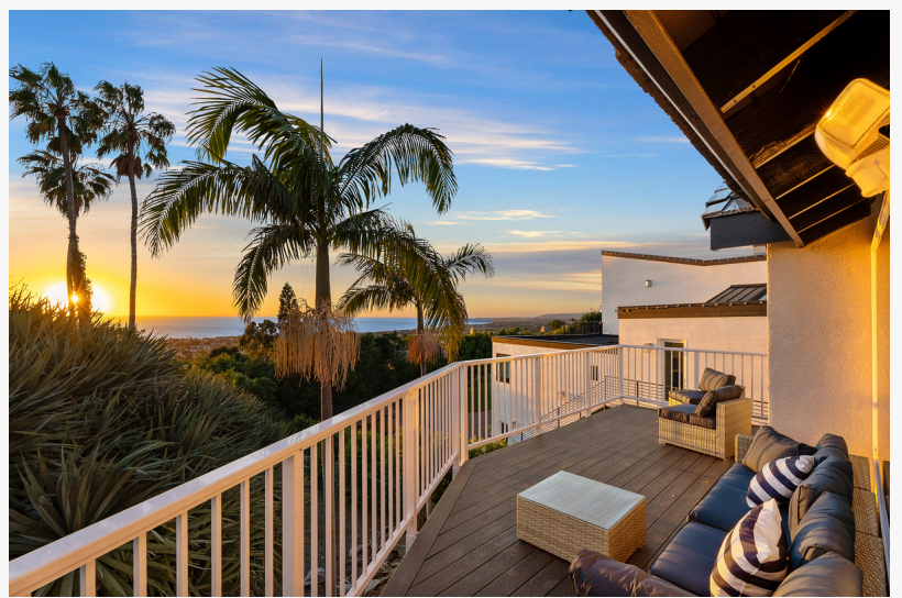
Oceans Luxury Rehab just steps away from the beach in Southern California

This press release can be viewed online at: https://www.einpresswire.com/article/787125011