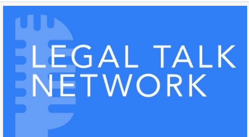
Legal Talk Network