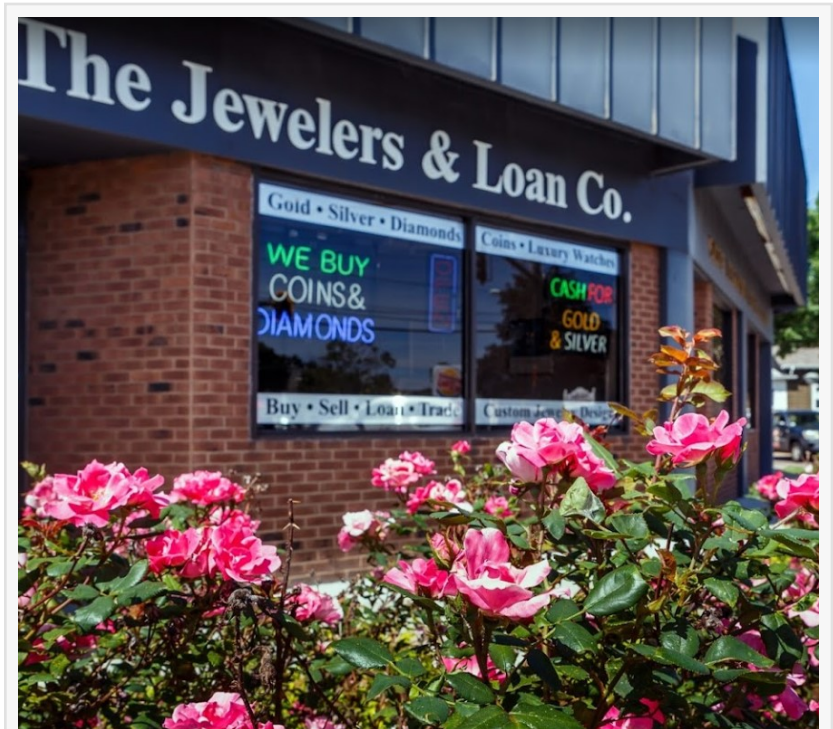
The Jewelers Coin & Loan Co. Quincy, MA.