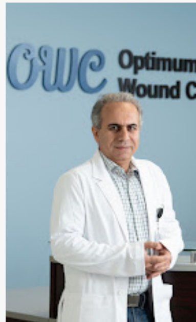
Bringing Cutting-Edge Treatment to the Community