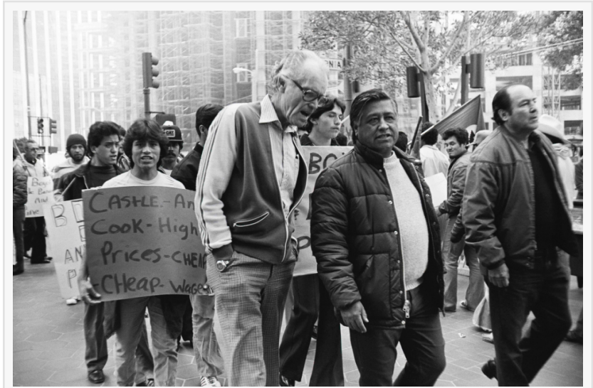
Fred and Cesar Chavez on the Picket Lines

The film and its Impact Campaign include thousands of organized screenings around the country, lesson plans and curricula for 1) K-12 classrooms, 2) Union trainings 3) adult education and discussion guides to be used as tools to inspire and train organizers, young and not-so-young, and to build the kind of effective and enduring organizations across this country needed to achieve equity and justice, and to preserve the health of our fragile democracy and the planet we all inhabit.