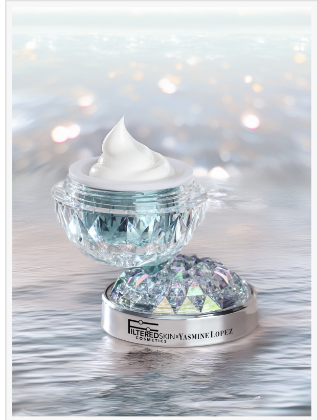
Yasmine Lopez filtered skin Jar Day Cream

Yasmine Lopez, known for her radiant beauty and impeccable style, has teamed up with Filtered Skin Cosmetics to create a line of skincare products that are not only effective but also ethical. Made in the USA, these products are vegan, gluten-free, and paraben-free, ensuring that they are kind to your skin and the environment. Each product has been rigorously tested and is FDA compliant, guaranteeing the highest quality and safety standards.