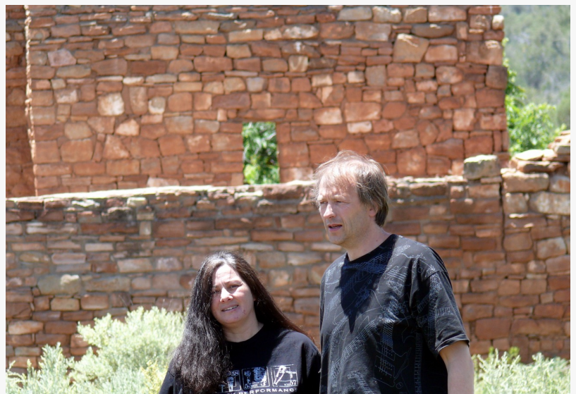
The artists' exploration of the Kinishba Ruins in Arizona, USA

Between Worlds and Kinishba are available as CDs, digital streaming and downloads, including high resolution studio master formats.