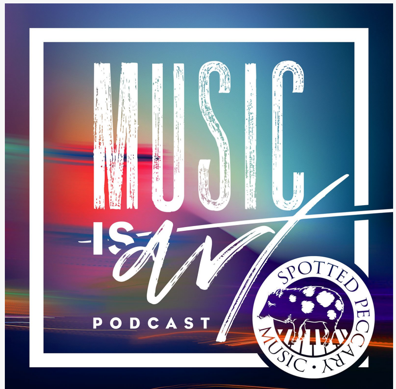
Music is Art Podcast: at the intersection of sound and artistic expression – exploring the boundaries of the progressive Ambient and Electronic sonic landscape.