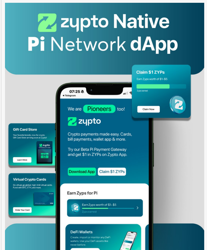
Zypto Pi Network dApp for Pi Coin Payments