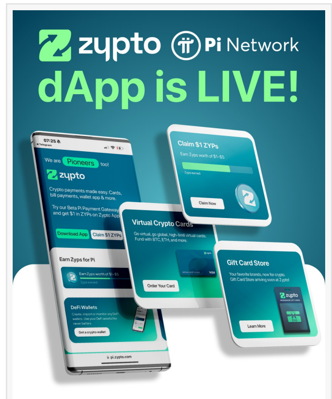
Zypto Pi Network dApp is Live!