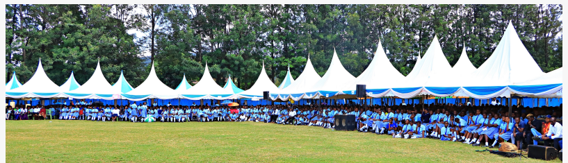
Kereri Girls' students follow proceedings during the launch.